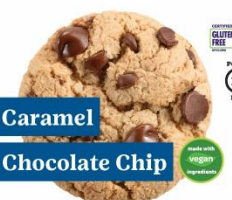
Caramel Chocolate Chip

Crisp and crunchy oatmeal cookies with creamy peanut butter filling