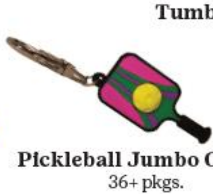
Pickleball Jumbo Charm 36+ pkgs.