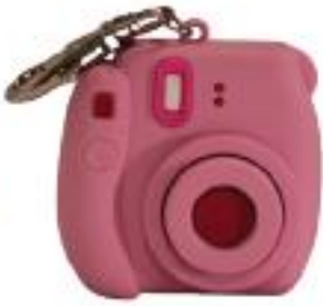
Camera Jumbo Charm 210+ pkgs.