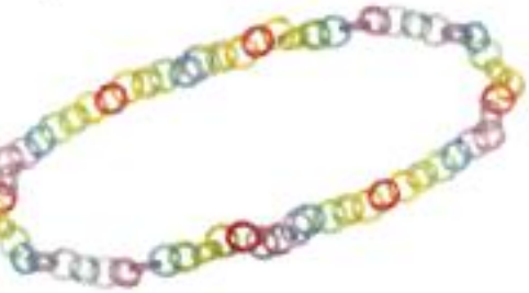
Colorful Charm Chain Signed Permission Form