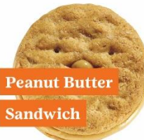
Peanut Butter Sandwich

Crispy cookies topped with caramel, toasted coconut, and chocolaty stripes