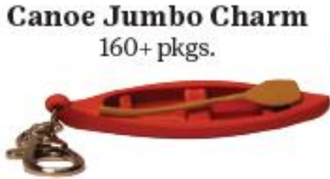
Canoe Jumbo Charm 160+ pkgs.