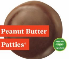
Peanut Butter Patties®

Crispy chocolate wafers dipped in a mint chocolaty coating